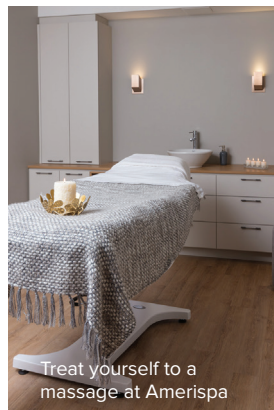
Treat yourself to a massage at Amerispa