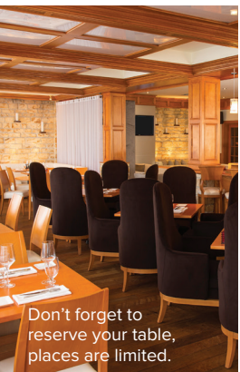
Don't forget to reserve your table, places are limited.