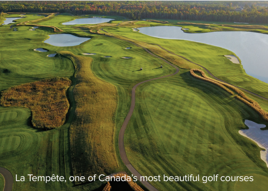
La Tempête, one of Canada's most beautiful golf courses