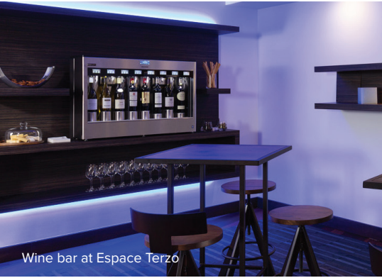
Wine bar at Espace Terzo