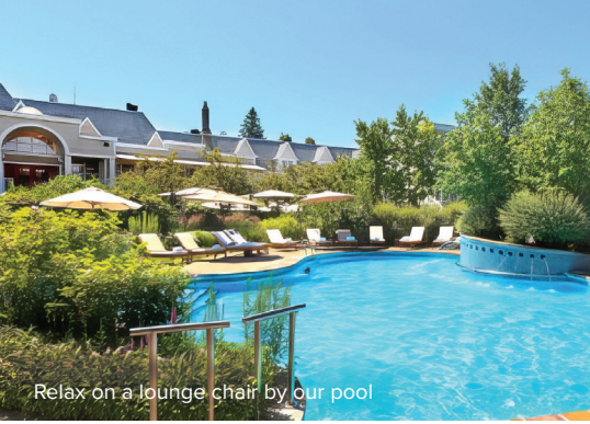
Relax on a lounge chair by our pool